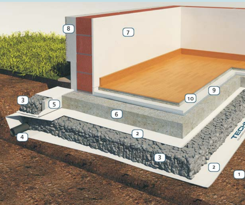
Key / marking floor construction scheme